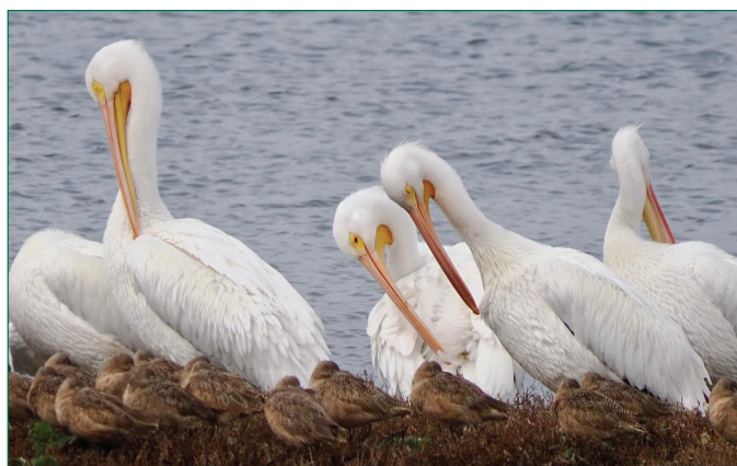
American White Pelicans

Take Highway 101 to Petaluma. Go East on 116 (Lakeville Highway). Turn right (south) on S. McDowell Blvd. Turn right on Cypress Drive. Go to the end of the road and through gates. Meet near the restrooms. Info: (559) 779-5211. Rain cancels