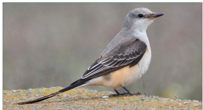
Scissor-tailed Flycatcher

(Rescheduled from Nov. 18) -- We'll enjoy a quiet, early morning walk near the open space land, listening, observing for winter birds and resident wildlife. We'll talk about the importance of this land and area for grassland habitat, badgers, and coexistence with other wildlife and birds. We'll walk uphill to view the wildlife corridor. If you joined an earlier walk, return and share the hour with us and new participants to experience the early winter morning. Ample parking is nearby. Rain cancels. Small group is best, so please reserve a space. Text or call 707-241-5548 or email susankirks@sbcglobal.net