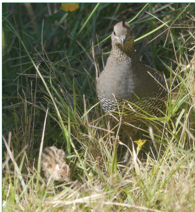
California Quail with Chick

I get it. The Tubbs fire burned to within a quarter mile of my home. My brother lost everything to that horror. A business acquaintance died in her home. The parents of a workmate didn't make it either. Naturally, we are going to value human safety over wildlife safety. But that leaves our responsibility to protect and preserve open space and safe havens all the more important. On my little preserve, my actions really matter. It takes more savvy and planning, more creativity and determination. And I have made hard compromises.