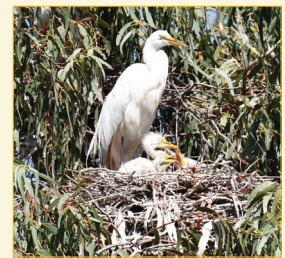
Great Egret Family

Join us on Zoom to envision a new paradigm in July 4th “entertainment” in Sonoma County. We’ll share examples of cities and communities in California embracing this change. Each year, fireworks cause harm to birds, wildlife, pets and domestic animals, veterans and others who experience post-traumatic stress disorder, and individuals, including those with health conditions (air pollution impacts). In the recent past, instead of fireworks on July 4th, drone light shows have been provided for entertainment. We’ll look at history, impacts, cost-benefit and other comparisons – which town or city in Sonoma County could lead the way, similar to other California cities? Following our presentation, we’ll share an open discussion. Bring stories and thoughts to share.