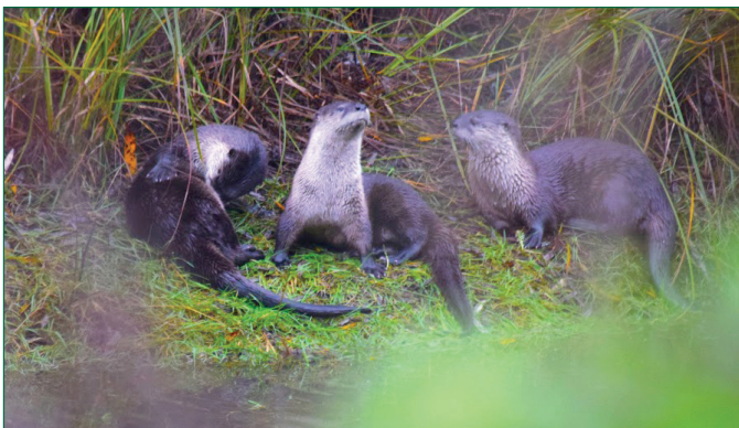
Resting River Otters