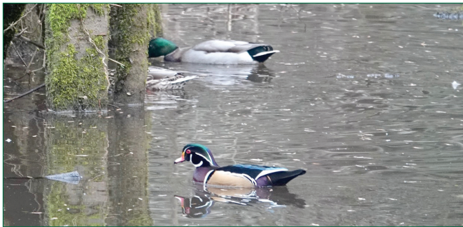
Wood Duck and Mallard

Area 20 was the result of some mathematically challenged person. There has never been as far as we can determine an area 20.