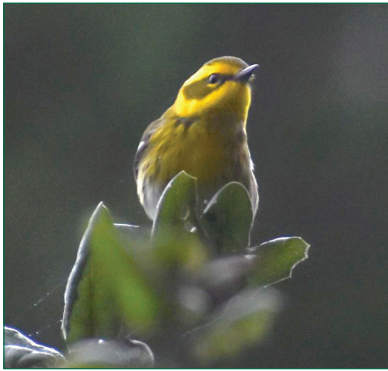
Townsend's Warbler