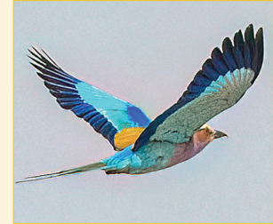
Lilac-breasted Roller in Ontawanga Delta

Jim and Linda Thomason traveled to South Africa in July and August 2022 on a birding tour with Alvaro Jaramillo. They also traveled on their own to Zimbabwe and Botswana after the tour to see more birds in those countries. About 850 bird species have been recorded in South Africa, only slightly less than are found in Costa Rica. The group counted 304 species seen in 14 days in South Africa. While most travelers to Southern and Eastern Africa are first attracted to mammals found there, everyone we know who visits quickly finds the birds fascinating—birds of all sizes and shapes, often with exquisitely colorful plumage.