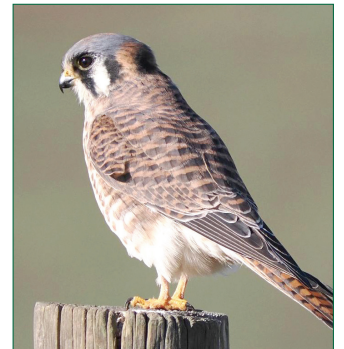
Female American Kestrel

Parking permit is required and can be purchased at the park. We will walk the paved path to look for raptors, bluebirds, and meadowlarks. If group would like, we can continue over the hill and around, back to the parking area. More info: (707) 526-5883.