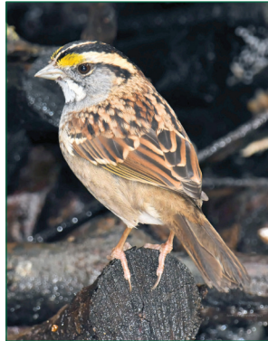
White-throated Sparrow

Take Petaluma Hill Road to Pressley Road (Rohnert Park). Use your County park pass or buy a day pass there. Mostly level to easy rolling hills. Rain cancels. More info: (707) 526-5883.