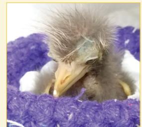
Black-crowned Night Heron in Care

Due to the rich diversity of Northern California habitats, The Bird Rescue Center cares annually for thousands of native birds. Their patients are a combination of songbirds, raptors, and waterbirds. Most birds have injuries resulting from human-related interactions such as flying into windows, being electrocuted by utility wires, being hit by cars, being attacked by pet cats, and more. They also receive