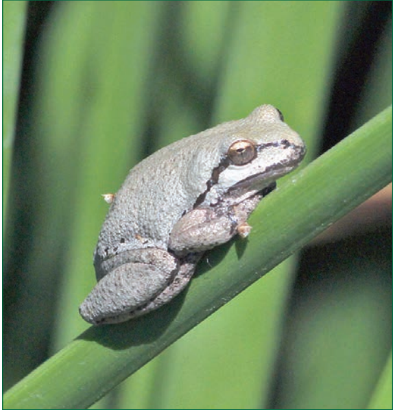
Sierran Tree Frog