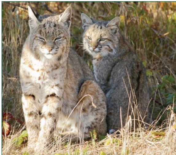
Bobcat Mom and Kitten