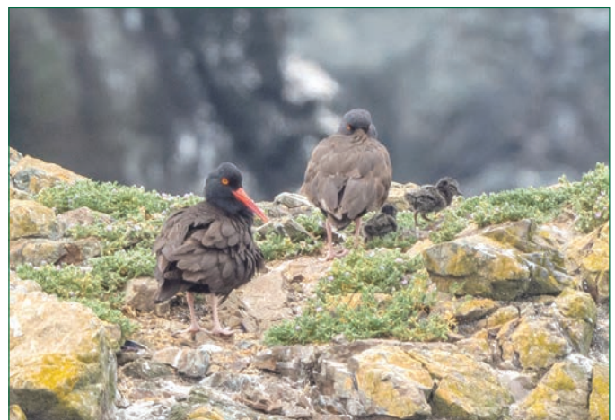
Black Oystercatcher plus 2 Chicks

Since July, the thousands (more like millions) of shorebirds that nest in Alaska and thereabouts have been migrating south for winter. They are arriving along our coast. In mid-summer, we only see what nests here; at Sea Ranch with a rocky coast and few beaches, the nesters are Black Oystercatchers, Spotted Sandpipers, and Killdeer. Now we are seeing some recently fledged Black Oystercatchers. They may not be quite as big as the adults and their bill will be two-toned because it is a fledgling. On the north coast, we continue to monitor nesting oystercatchers, in 2022 participating in a new 5-year study From Mendocino to Monterey. The intention is a better assessment of the health of the population as we follow a random sampling of nests, not just the easy-to-observe and obvious ones. Of the five in our random sample, one did not nest in 2022, one failed after several weeks, one had eggs, then chicks that disappeared, one failed and re-nested to raise 2 chicks, and one nested early and fledged a chick. So we