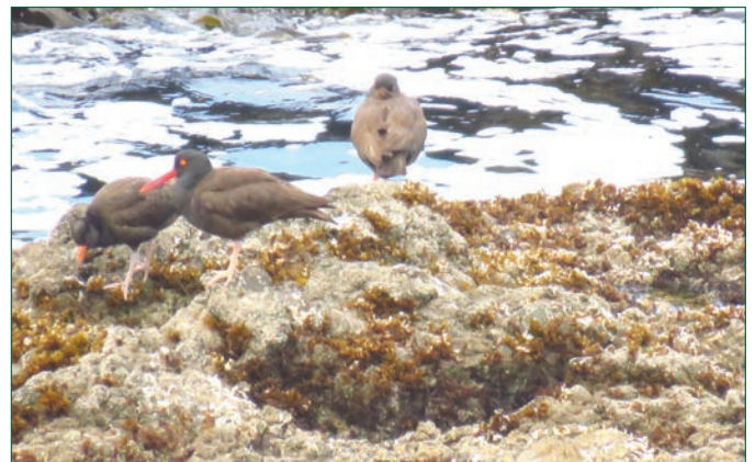
Black Oystercatcher Fledgling

All About Birds describes the Common Murre: Gives low-pitched, guttural calls and a longer, braying aaaaarrrr, ARR-ahh. These calls are only heard during the nesting season at or