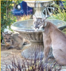
Seeking Water