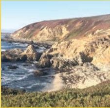
Bodega Head