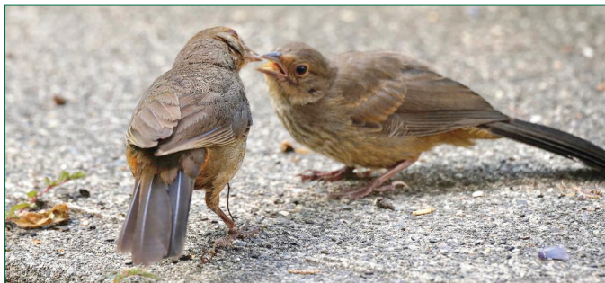
California Towhee, Feeding Time

Next stop was a bike loop around Shollenberger Wetland, very wet this year. I got lucky. First, three Black Rails chimed up along the path out from the Point Blue office. “Kick-ee-dooos” and growling. Of course, I saw nothing in the pickleweed beside the path, but my Merlin app agreed that my recording was indeed of a Black Rail. Then, Peter Colasanti’s Tufted Duck popped up amongst the Scaup feeding on the river. Topping it off, the continuing juvenile Glaucous Gull paraded among the loitering gulls opposite the north side path. Cliff Swallows are back, as several were with a large flock high over the Alman Marsh.