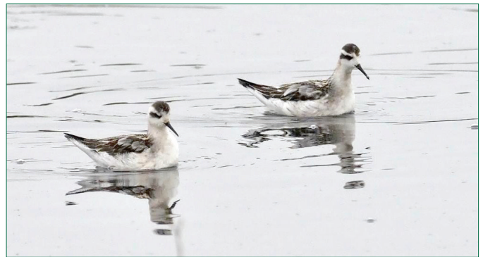
Red-necked Phalarope

Parking pass is required. Please call (559) 779-5211 to reserve a space. We will meet at the parking area next to the Swim Lagoon (Violetti Entrance). We will travel North and circle the Lake. If you find you are unable to attend, please call Linda to free up a space for a wait-lister. Parking pass is required. Info: (559) 779-5211.