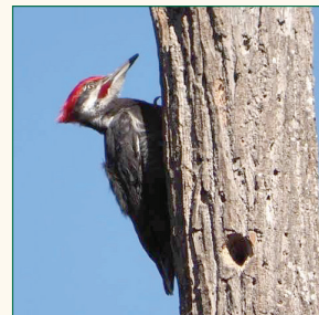
Pileated Woodpecker