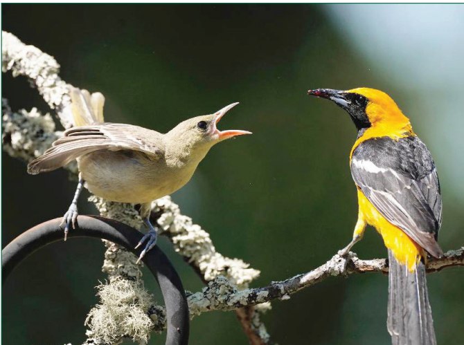
Hooded Orioles, Feeding Time