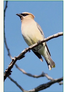
Cedar Waxwing