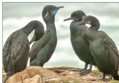
Brandt's Cormorants

and white Common Murres, our "penguins of the north" atop Gualala Point Island, were first confirmed nesting in Sonoma