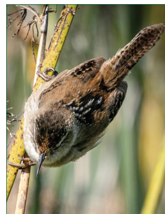
Marsh Wren