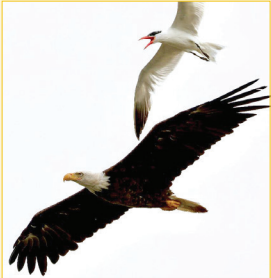
Bald Eagle and Caspian Tern