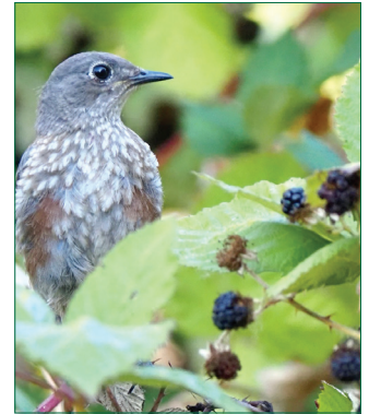
Juvenile Western Bluebirds