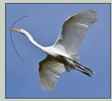
Great Egret with nesting material