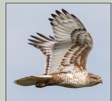
Adult Ferruginous Hawk