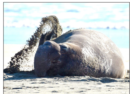
Elephant seal