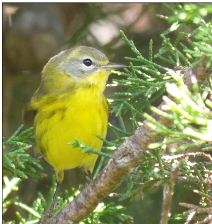
Immature Pine Warbler

North Beach and Limantour Spit. The open fields in the area are also important for open-country migrants and winterers, including shorebirds such as the localized Pacific Golden-Plover, which winters at just a handful of sites in California. Finally, the scattered clumps of trees associated with ranch yards within this IBA have long been known as important migration hotspots, with hundreds of songbirds crowding into planted groves of cypress, particularly in fall. The Pt. Reyes