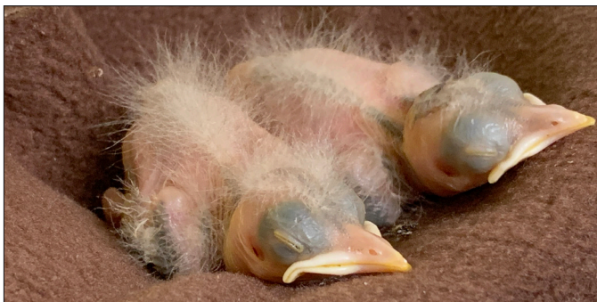
American Robin Hatchlings Native Songbird Care & Conservation (NSCC)

As hatchlings, 0-4 days of age, songbirds are naked with scant tufts of natal down, helpless, their eyes are closed, and they’re unable to thermoregulate (maintain their body temperature). At this stage, they remain in their nest and without the constant care of their parents, will quickly die of hypothermia and starvation.