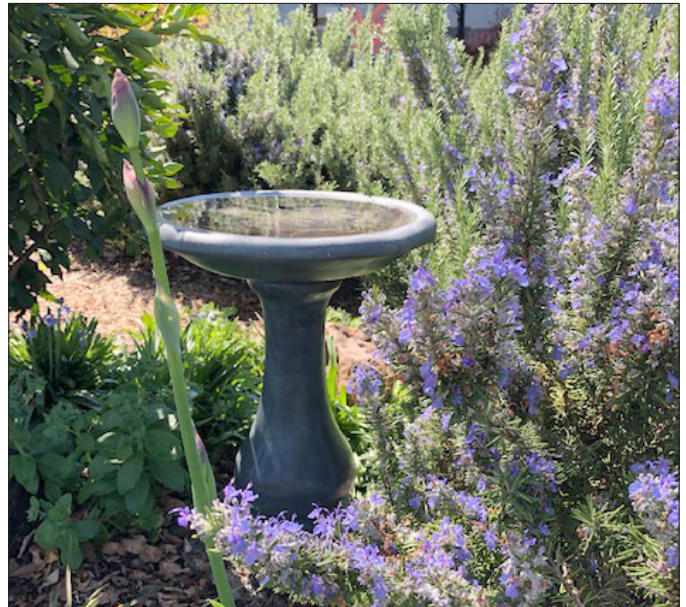
Petaluma Regional Library Birdbath

This winter, I hung a perforated metal tray from tree branches and placed suet cakes on the tray. All day long, I see White-crowned and Golden-crowned Sparrows pecking at the suet. At night, I bring in the tray and wash with sudsy warm water. Next morning, 20 or more birds may be waiting for the suet. They provide interesting viewing from the window all day long. If you decide