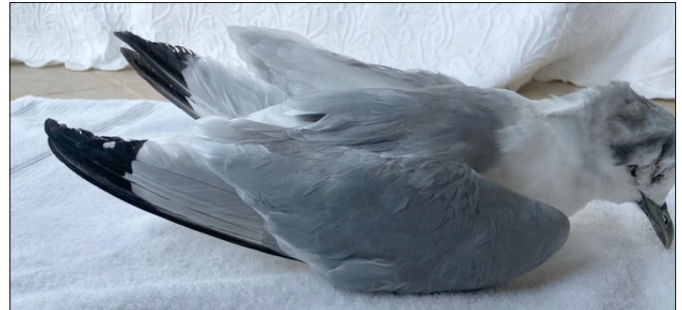
Black-legged Kittiwake (deceased)

several colored bands. It had been banded 07/03/2002 “as a bird too young to fly” at Middleton Island, Valdez-Cordova Alaska. This nearly 19-year-old bird has gone to the California Academy of Sciences for its collection.