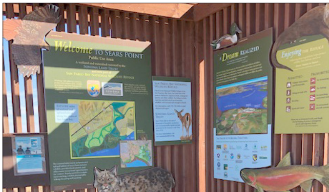
Interpretive Area – Baylands Public Access

We'll be hearing a lot about State Route 37 in the coming years. A process has begun to redesign this nightmare roadway, address climate impacts, including sea level rise, and