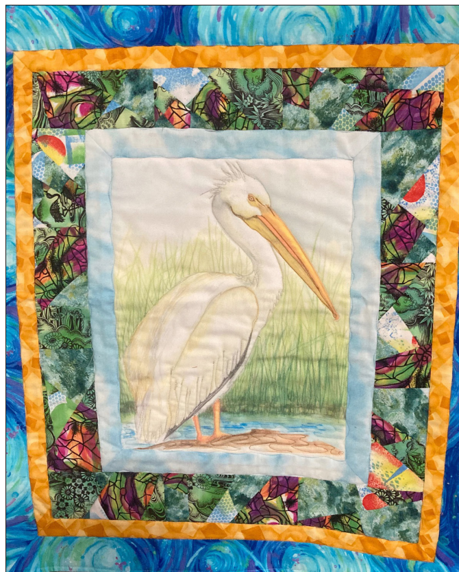
American White Pelican Wall Hanging