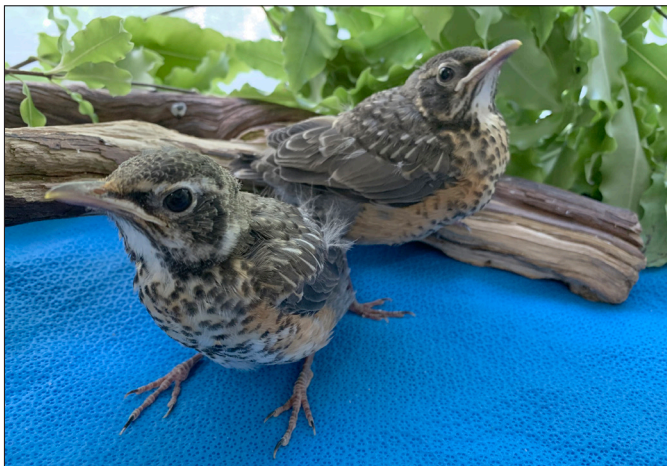
American Robin Fledglings Native Songbird Care & Conservation (NSCC)

The most common call we receive at Native Songbird Care & Conservation during the baby bird season is when a good Samaritan encounters a baby bird on the ground and they're not sure if the baby needs help. Babies that are obvious hatchlings or nestlings always need help, but what about babies that are fully feathered who can stand and hop, but cannot fly? Is it a fledgling doing what fledglings do? Well, that all depends on the species.