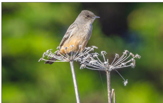
Say's Phoebe

It was a year of pleasant surprises! Following a Zoom bird review, there was a surge of interest so we had lots of people in the field (54) and others at home feeders (14). At the Zoom wrap-up, participants were enthusiastic about the day. Our Species count was 105; then a few more trickled in: Red Crossbills had been seen on Saturday afternoon in firs at the NW corner of the airstrip. A few Cedar Waxwings and a single Brown-headed Cowbird at a feeder brought our Species Count to 108. And our Total Individual Birds, 6,103!