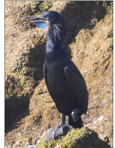
Brandt's Cormorant, plumes