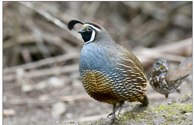
CA Quail and Sooty Fox Sparrow

Farallon Islands – The proposed drop of a 2nd generation anticoagulant poison (Brodifacoum) over the islands may be revisited at the May 2021 meeting of the California Coastal Commission. Our Audubon Chapter, along with many conservation organizations, has expressed ongoing concern with questions about the efficacy and risks of the proposal. A multifaceted alternative project to protect the Ashy Storm-Petrel and address the mouse population deserves attention and consideration. Such an alternative includes capture and relocation of the 6-8 Burrowing Owls over-wintering on the islands, a mouse fertility control product under development and predicted to be available for use in 2021, and an extended