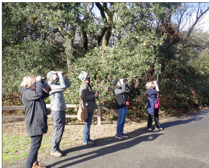
January 2021 Ragle Ranch