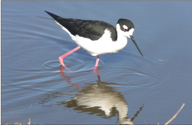
Black-necked Stilt

How can there be surrounding peace? SR 37 is also reachable via Lakeville Highway 116 from Petaluma. This connection opens for us the experience of wetlands, the Bay, and a serene environment. Just 15 minutes southeast of Petaluma on Lakeville Highway at the SR 37 intersection, one can drive