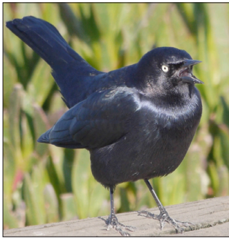
Brewer's Blackbird Posturing

With a creative spirit, you can provide a sanctuary for birds and other wildlife in a small place. It's possible to entice several species of birds into a carefully planned garden patio. The birds will most likely be small ones such as sparrows, finches and hummingbirds. Depending on choice of plants, trees, vines and shrubs you may be also rewarded with butterflies.