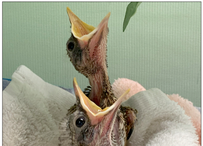
American Robin Nestlings

Baby birds go through specific stages of growth and development before they become independent and no longer require the care of their parents. Their behavior and need for parental care varies at each stage. If you encounter a baby bird that you suspect may need to be rescued, some knowledge of their natural development is helpful.