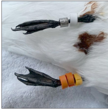
Bands – Black-legged Kittiwake

At Gualala Point, we had 300 rafting on the water. These pre-season rafts on the water and rock attendance are evidence of an established murre colony. (And it was just 2012 when we confirmed murres breeding in Sonoma County at both locations, Jenner and at Sea Ranch.)