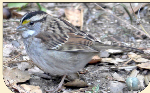
Golden-crowned Sparrow