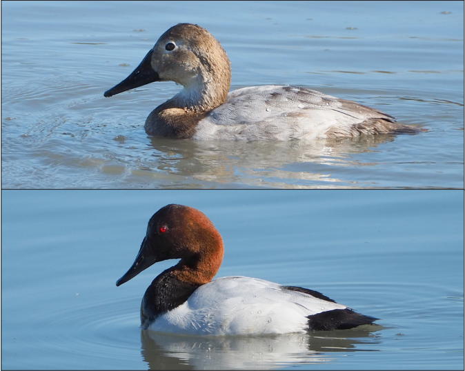
Canvasback Ducks (Female - top, Male - bottom)

SR 37 traverses the northern shore of San Pablo Bay, linking US 101 in Novato, Marin County, with Interstate 80 (I-80) in Vallejo, Solano County. It is a vital connector among Marin, Sonoma, Solano and Contra Costa Counties and the Central Valley. Sonoma County Transportation Authority describes SR 37 as the "northernmost non-mountainous east-west link between US 101 and I-5 (via I-80 and I-505)" in California. Most of us know the SR 37 drive as congested, with accidents and unpredictable travel times. It can be a nightmare. The end of life for wildlife trying to cross SR 37 is worse than our delayed travel times.