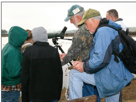
Petaluma CBC for Kids

Come join us for the 5th Annual Petaluma Christmas Bird Count for Kids; a half-day of bird-watching designed for kids ages 9-15. This event is co-sponsored by the Petaluma Wetlands Alliance—a committee of the Madrone Audubon Society—and the City of Petaluma Parks and Recreation Department.