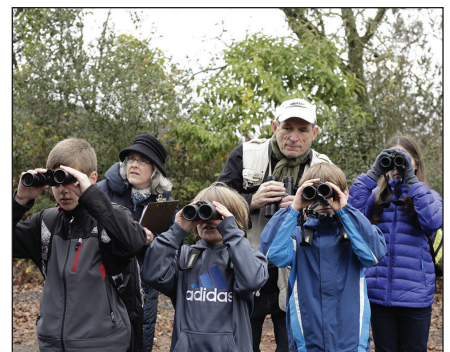
Sonoma Valley CBC for Kids

Celebrate winter birding at the 7th annual CBC4 Kids in Sonoma Valley. Experienced birders will lead small teams on 90-minute birding routes following registration, orientation, and “Binocular Boot Camp.” One adult per youngster ages 8-16. Team presentations will be in Andrews Hall followed by pizza and drink in the Rotary Kitchen. A “Budding Birder Camp” for kids ages 4-7 will be offered for the younger family members by the Crescent Montessori School while their older brothers and sisters are out birding.