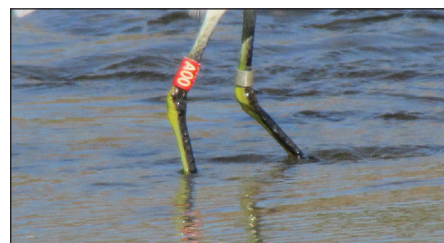
Snowy Egret leg band