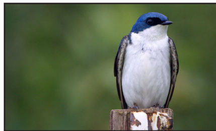
Tree swallow photo courtesy of the film

The Messenger chronicles the struggle of songbirds worldwide to survive in turbulent conditions brought about by humans and argues that their demise is akin to the disappearance of honeybees and the melting of the glaciers. This beautiful movie aims at both the head and the heart, celebrating the amazing beauty and strength of our avian friends while also exploring the reasons behind their dramatic disappearance worldwide.