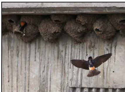
Cliff Swallow nests on Bridge Christopher Chung, Press Democrat 5/18/15

provided input at the December meeting that the scheduled removal would likely coincide with the exact time large numbers of cliff swallows will have arrived and be constructing nests. Based on our past observations, there is a high likelihood nests will be completed and occupied before the Caltrans contractor can effectively scrape or pressure wash to remove nest starts. The ability to actually visualize nests in various stages underneath this platform by Caltrans-contracted biologists and the contractor was also met with serious doubt by Plaintiff representatives. Legal counsel for Plaintiffs has submitted correspondence to Caltrans which push forward several requests and expressions of concern. At this printing, we await Caltrans' response.