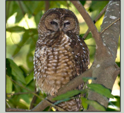
Northern Spotted Owl

Over the last 50 to 100 years, the eastern Barred Owl has made its way to the western United States. Presumably helped by human landscape alteration, the species now inhabits all of the range of the endangered Northern Spotted Owl. In recent years, evidence is mounting to suggest that Barred Owls have become a primary threat to Spotted Owls—they are fierce competitors, aggressive territory holders, and faster reproducers, and have even been anecdotally reported to kill Spotted Owls. And they are spreading faster than ever. Jack Dumbacher will discuss the natural history and conservation concerns for both species and the potential actions proposed by different management agencies.