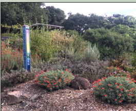
Native plant garden at NSCC

Your garden is your outdoor sanctuary. With some careful plant choices, it can be a haven for native birds as well. Landscaped with native species, your yard, patio, or balcony becomes a vital recharge station for migratory birds passing through and a sanctuary for nesting and overwintering birds. Recent wildfires have also resulted in yards as destinations for nutrition and stability.