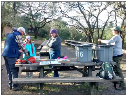
Enjoying treats before the walk

On Saturday, December 16th, 18 participants enjoyed sunny weather with a little wind for the Holiday Bird Walk at Spring Lake . Modeled after the Christmas Bird Count for Kids (started by