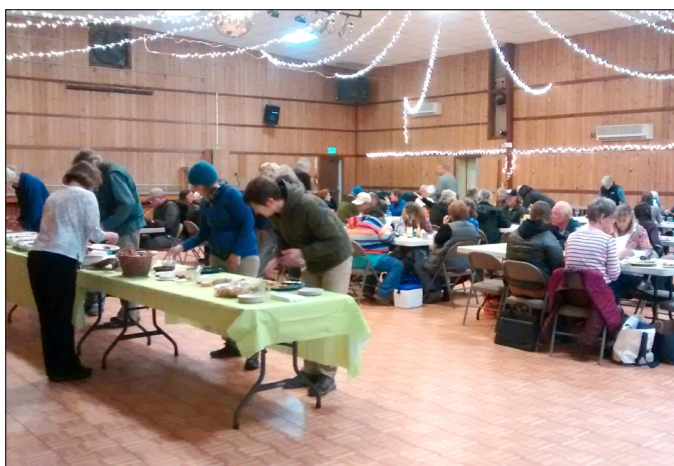
Madrone Audubon post CBC dinner