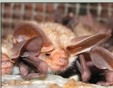
Pallid bat

Bats form the second largest mammalian order, and yet much about them is unknown. Come find out about bats, the only mammals capable of true flight.