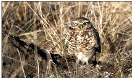
Burrowing Owl off Coleman Valley Road

Sonoma County's three Christmas Bird Counts (CBCs) took place the last two weeks in December, 2017, with tentative results showing reduced numbers of both species and total individual birds in those count territories directly hit by the recent fires. Although the fires undoubtedly had an impact, it is not entirely clear how this affected the numbers when taking into account normal annual fluctuations and the continuing effects of global climate change.