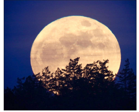
Moon over Sonoma County