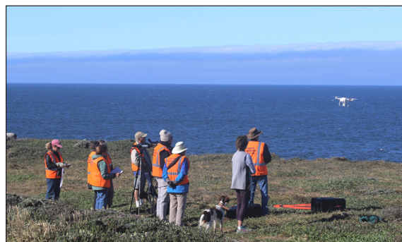
Coastal Stewardship Taskforce volunteers with drone

We also begin Year 3 of a permit from Greater Farallones National Marine Sanctuary to help develop “No Disturbance Protocols” to use when flying a drone to track activity in a