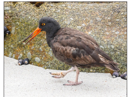
Black Oystercatcher with injured foot

seabird colony. In the Low Overflight Zone around Gualala Point Island—put in place to protect the nesting of Brandt’s Cormorants, Common Murres, Western Gulls, Pigeon Guillemots and Black Oystercatchers---a plane cannot fly lower than 1000 ft, and a drone is not allowed to fly higher than 300 ft! While a researcher may approach cautiously with a drone, and at high elevation, recreational users often buzz low and loud without realizing they are disturbing nests and wildlife! We are working to fine-tune how to approach, and photograph, the nesting seabirds without creating any issue for the birds.