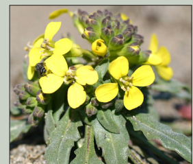
Erysimum menziesii (Menzies wallflower) Ten Mile Dunes