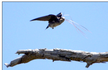
Purple Martin with nesting materials

behalf of the many volunteers who conducted field observations each year during breeding seasons from 2011 to 2016. With the county divided into 195 squares, or blocks, 5 km on a side, volunteers gave 9,283 hours surveying 187 blocks, or about 96% of the county. These observations yielded a confirmation of breeding for 161 species, up from 148 species during the first Atlas. Madrone is fortunate to note that a few volunteers participated in BOTH the original BBA survey led by Betty Burridge 1986-1991 and the 2011-2016 survey. Some new species identified in the 2011-2016 survey include Mute Swan, Eurasian Collared-Dove, Barred Owl, and Great-tailed Grackle. In the not too distant future, Gordon will coordinate publication of the analysis and BBA via a new website link.