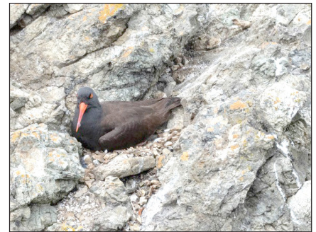
Black Oystercatcher on nest

Our Coastal Stewardship Task Force and additional volunteers have been watching and monitoring BLOY nests since 2011. At a recent working group meeting, with representatives from Washington, Oregon, US Fish and Wildlife Service, and California representatives from San Luis Obispo, Monterey, San Francisco Bay, Sea