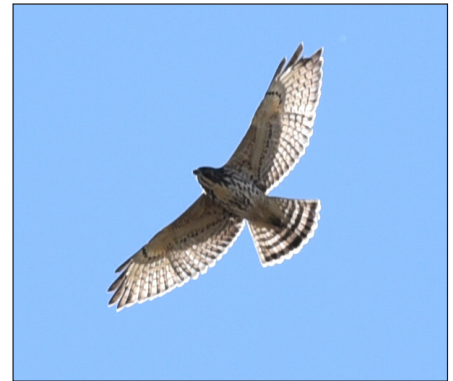
Broad-winged Hawk, Bay Hill Rd.