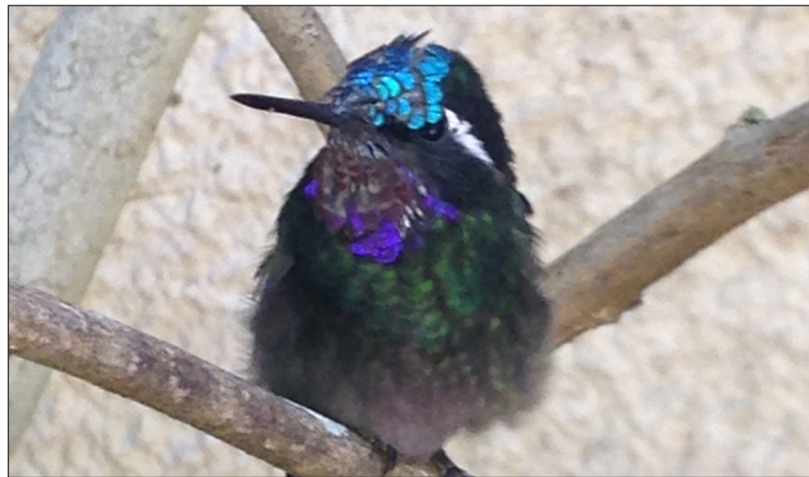
Purple-throated Mountain Gem