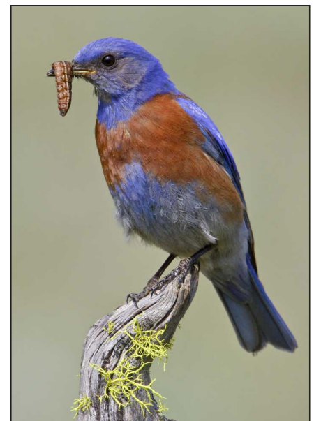
Western Bluebird