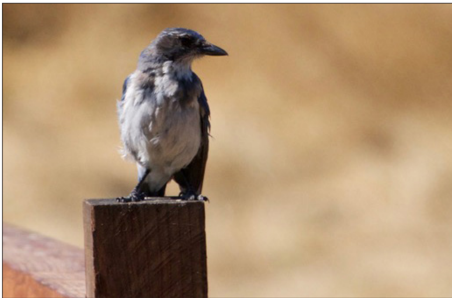
Western Scrub Jay

In conjunction with the book signing by Jane Alexander at Copperfield's in Petaluma on October 20th (see Wild Things, Wild Places Author Coming to Sonoma County on page 4), we'll host guided walks at the Nature Preserve that day at 4:30 and 5 PM. We'd love for our members to attend the book event and also appreciate your continued support of our climate change impact research project .... so hope to see you there!