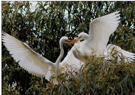
Great Egret young feeding

Each May at Abraham Lincoln Elementary School in Santa Rosa, there is a whole morning devoted to learning about birds and nature. We call it Bird Day, and it began over 10 years ago, inspired by beloved educator and