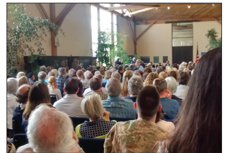
August 23rd forum

The Associated Press reported Interior Secretary Zinke sent recommendations to the White House related to 22 National Monuments, recommending to shrink "a handful" with several sources stating a recommendation to sharply reduce the Bears Ears Monument in