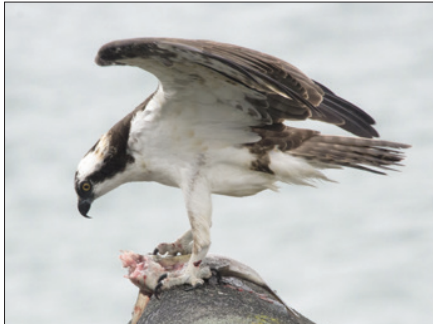
Osprey at Diekmann's Store

This year's teams included the Feather Questers, Burrowing Owlers, Zonotripias, Grey-headed Seersuckers, March Madness and Chickadiddies.