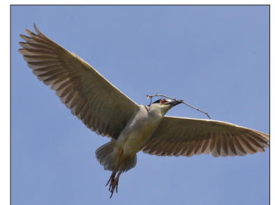
BCNH adult with stick

A juvenile Cattle Egret was the last noted rescue by volunteer rescuer Gayle Kozlowski on August 13th. Nesting season appeared to conclude this year in the third week of August. Each year, even with Madrone Audubon’s “big nest” of rice straw mats placed in the median under the two large Eucalyptus trees and over closed asphalt traffic lanes, a significant number of young nestlings fall and pass away, or fall and are struck by vehicles driving by in open traffic lanes. Sometimes, adult birds standing in the open traffic lanes are also struck and killed before they can lift off and fly out of harm’s way. The natural process of selection of the strongest nestlings, with weaker ones pushed out of nests or falling out, and landing on the ground below, or asphalt, or straw, is a rather messy process in many ways. This is also Nature. The intervention of volunteer rescuers from Bird Rescue of Sonoma County and our support project of enclosing the area under the trees and maintaining the “big nest” on the ground, as well as using our industrial sized broom to sweep around the area and keep it at least semi-managed, is a minimal intervention in Nature’s process, in an urban residential area, to support the amazing phenomenon of this large nesting site on West 9th Street. Often unseen except by those of us around the site quietly performing our tasks are some missed feeds of fish, small frogs, lizards, and lots of crayfish claws on the ground under the trees.