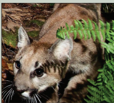
Young mountain lion

Join us to learn about the latest findings of the Audubon Canyon Ranch (ACR) Mountain Lion Project, a community-based research and education project in the Mayacamas Mountains of Sonoma and Napa Counties.