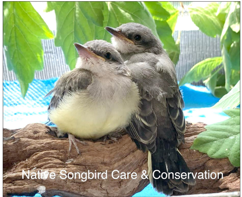
Western Kingbird Fledglings