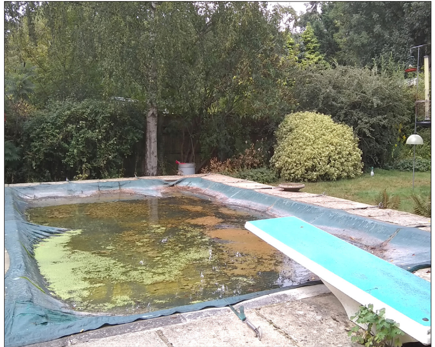
Swimming Pool and Cover