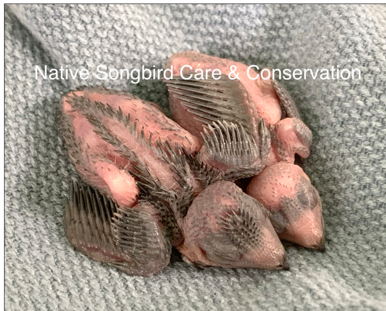
Vaux's Swift nestlings