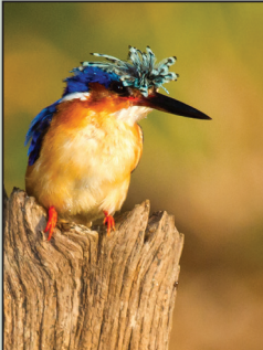
Malagasy Kingfisher