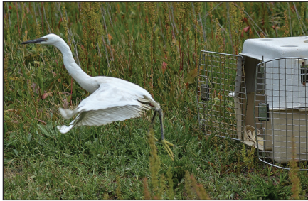
Snowy Egret

Madrone Audubon's "big nest under the trees" contributes to the collaborative effort and interfaces with the urban resi-