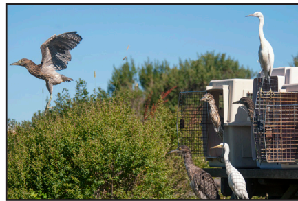
Emerging from the carriers

Ranch, in the annual documentation process for the North Bay Heron and Egret Project, observed nests daily. While total nest count data is not finalized as we go to press, a general 2016 conclusion has emerged. We appreciate Audubon Canyon Ranch sharing their data with us. In 2016, there were a total of 239-269 nests (a decrease compared to 325 total nests in 2015).