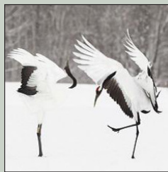
Red-crowned Cranes

Other birds the Madesons photographed include the Black-tailed Kite, White-tailed Sea Eagle, and the magnificent Stellar Sea Eagle, which is on average, the heaviest eagle in the world. Several owls will also be featured in their program, including the beautiful Snowy Owl. As recently as four years ago, Snowy Owls have been migrating to parts of Japan.