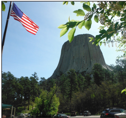
Devil's Tower

the Chestnut-collared Longspur, was the ABA bird of the year. We saw Cave Swallows going in and out of the banks below the hot springs in Thermopolis, and at one point, Sharp-tailed Grouse crossed the road right in front of us. Altogether, we tallied 112 impressive species. Not bad for sometimes birding at 80 mph on Interstate 80. We missed seeing many we'd expected to see, but it wasn't