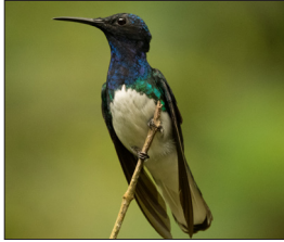
White-necked Jacobin Hummingbird

Wood Pewee MIGHT be a pewee in migration but more likely belongs to a totally different species of