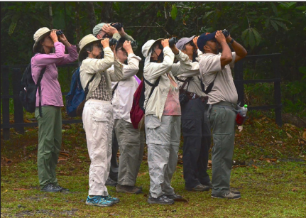
Seven birders in a row