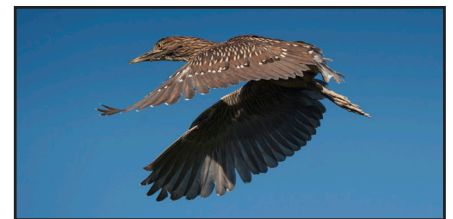
Juvenile Black-crowned Night Heron takes flight

We provide this support project each year as a coordinating and connecting addition via an encroachment permit from the City of Santa Rosa. This year, the City of Santa Rosa also responded to rescuers' concerns and our concerns by installing a speed limit tracking sign on W. 9th St. to identify speeding vehicles, which can be very dangerous for egrets or herons with no time to escape an oncoming speeding vehicle, sometimes striking and killing even adult herons or egrets. This is just one of the behind-the-scenes challenges of an urban nesting area hosting these magnificent birds, the adults of whom select this site and return to nest each year. The W. 9th Street nesting area is also a focal point of the annual Bird Festival hosted by Madrone Audubon and held each May at nearby Lincoln Elementary School. This is a day-long environmental and wildlife appreciation and education day for Lincoln Elementary students. On behalf of Madrone Audubon, we express gratitude for the continued dedication of the City of Santa Rosa, Audubon Canyon Ranch, Bird